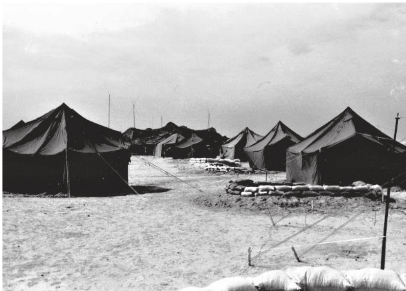
1st Infantry Division Artillery (DIVARTY) encampment with tents and foxholes in TAA ROOSEVELT (January 1991).