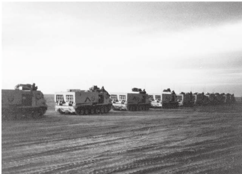
B Battery 6th Field Artillery MLRS convoy from TAA Roosevelt to the FAA (February 1991).