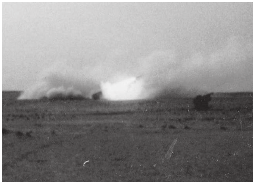
Close up of a Multiple Launch Rocket System (MLRS) rocket headed downrange during artillery raids (February 17–23, 1991).