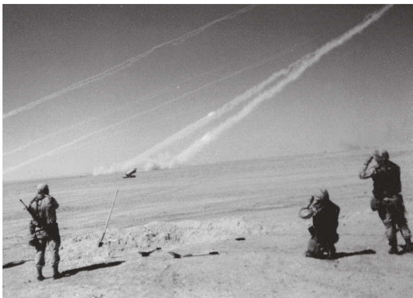
Soldiers from B Battery 6th Field Artillery MLRS observing a fire mission during artillery raids (February 17–23, 1991).