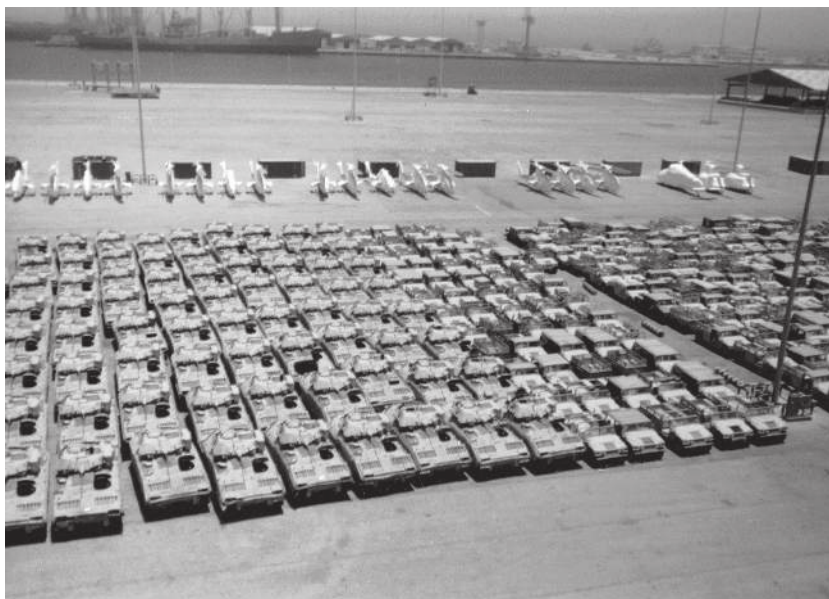
1st Infantry Division vehicles ready for loading on the Nosac Rover in Dammam, Saudi Arabia, June 8, 1991.