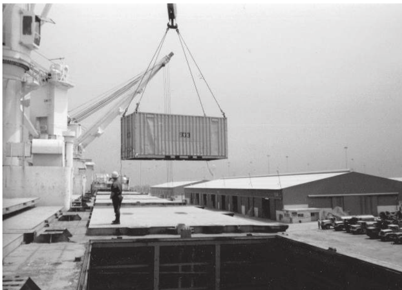
Big Red One Port Support Activity (PSA) lifts MILVANS (Military Container Vans) into the Ville de Havre , May 20, 1991.