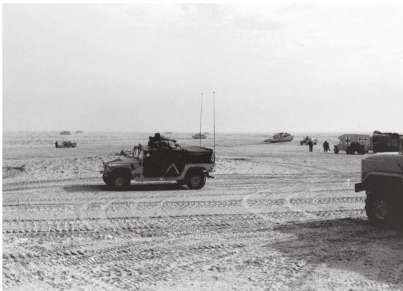
HMMWV (High Mobility Multi-Purpose Wheeled Vehicle), "Humvee," in forward assembly area (FAA) (February 1991).