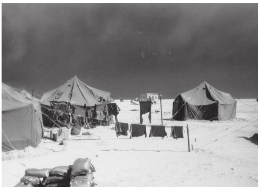
Laundry Day at the 1st Infantry Division Artillery (DIVARTY) position near Ar Rawdatayn, Kuwait (March 1991).