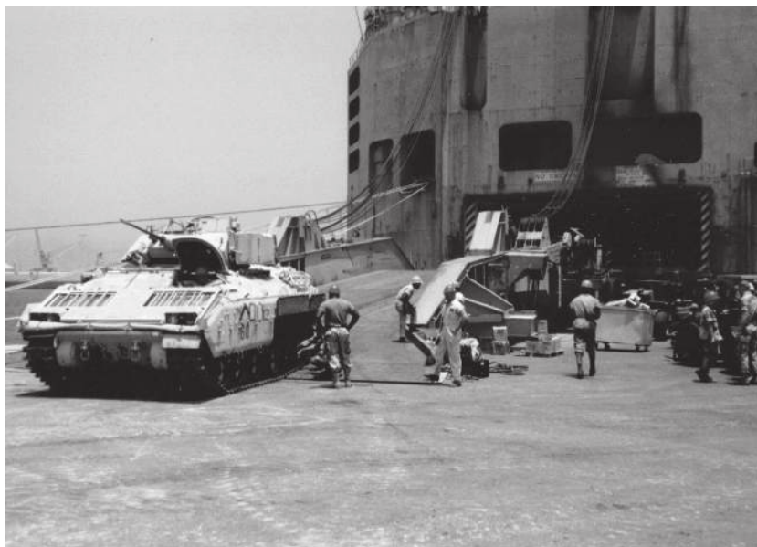
Big Red One Port Support Activity (PSA) loads an M2 Bradley Infantry Fighting Vehicle (IFV), June 8, 1991.