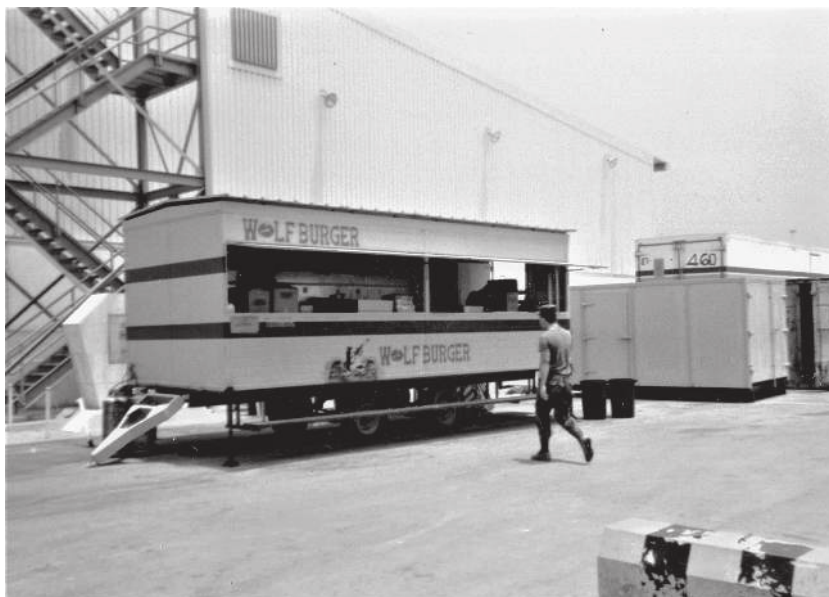
Soldier approaching a “Wolf Burger” for a lunch break while working in the port of Dammam, Saudi Arabia (May 1991).