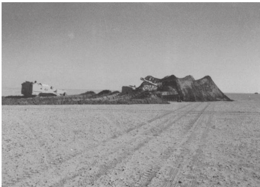
Armored Combat Earthmover (ACE) digging a survivability position for an M109A2 155mm howitzer of B Battery 1st Battalion, 5th Field Artillery (February 1991).