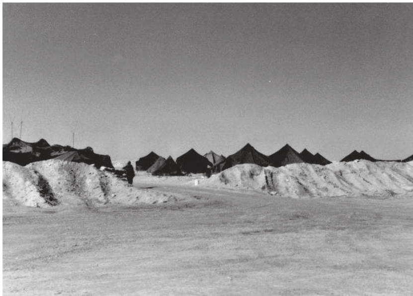
1st Infantry Division Artillery (DIVARTY) Tactical Operations Center (TOC) position in FAA behind protective berm prior to preparation (February 1991).