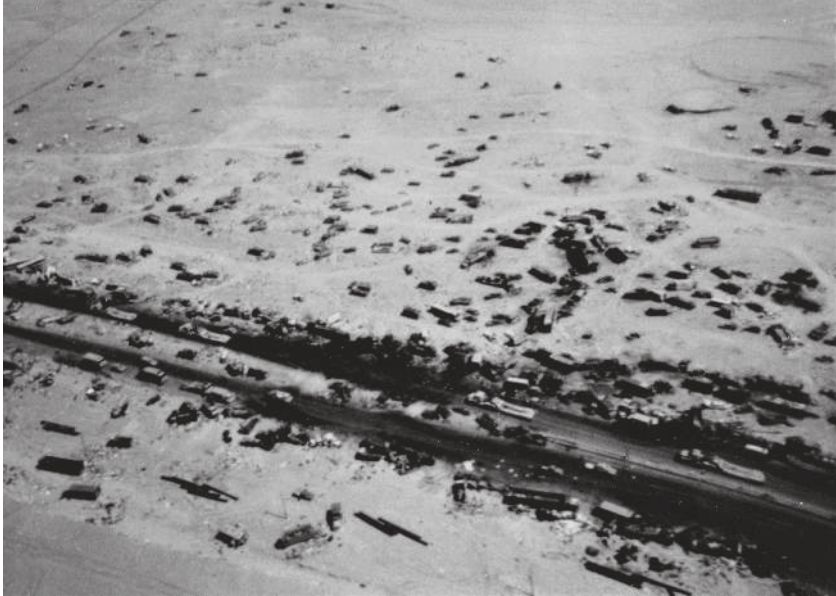
Numerous destroyed Iraqi vehicles and equipment in the vicinity of the “Highway of Death” in eastern Kuwait as they attempted to escape (February 28, 1991).