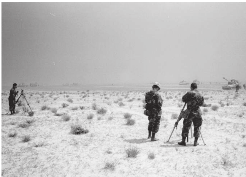
Soldiers using an M-2 aiming circle to orient M109A2 155mm howitzer of B Battery 1st Battalion, 5th Field Artillery on the direction of fire (February 1991).