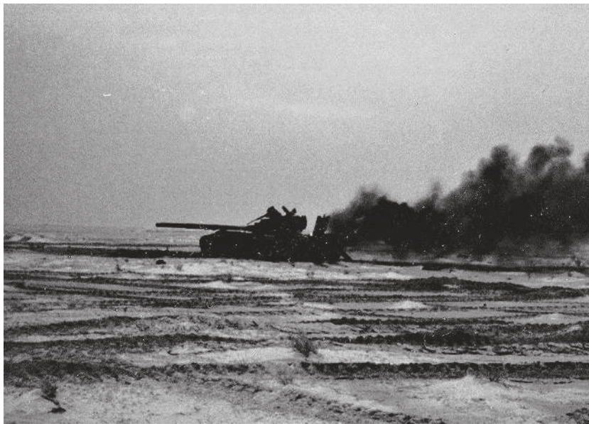
Destroyed Iraqi tank in the vicinity of Objective Norfolk in Iraq (February 27, 1991).