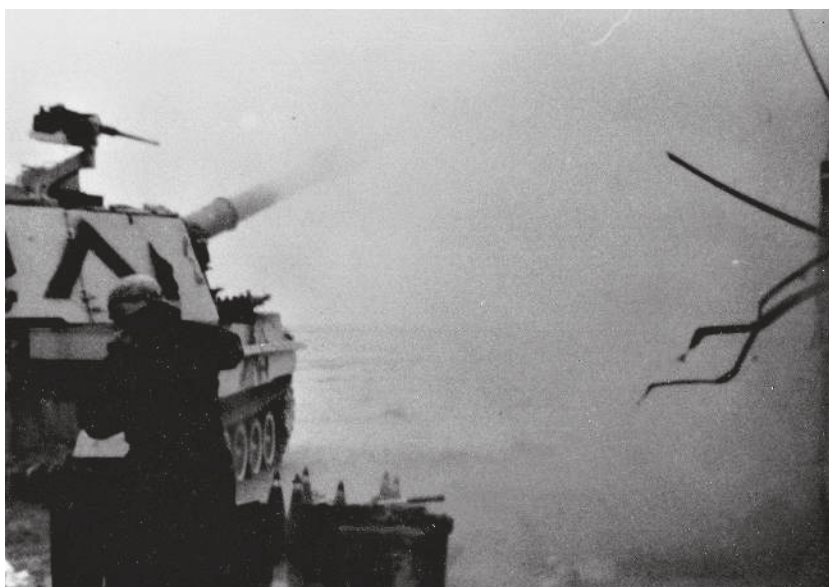
M109A2 155mm howitzer firing on enemy positions (February 1991).