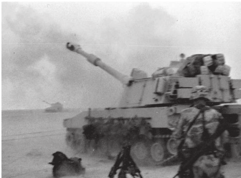
A pair of M109A2 155mm howitzers firing during artillery raids (February 17-23, 1991).