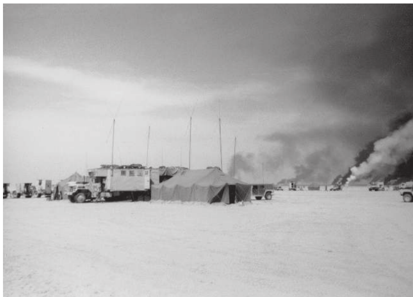
1st Infantry Division Artillery (DIVARTY) Tactical Operations Center (TOC) position near Ar Rawdatayn, Kuwait, approximately 25 kilometers south of Safwan Iraq (March 1991).