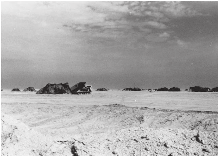
B Battery 6th Field Artillery MLRS position in TAA Roosevelt (January 1991).