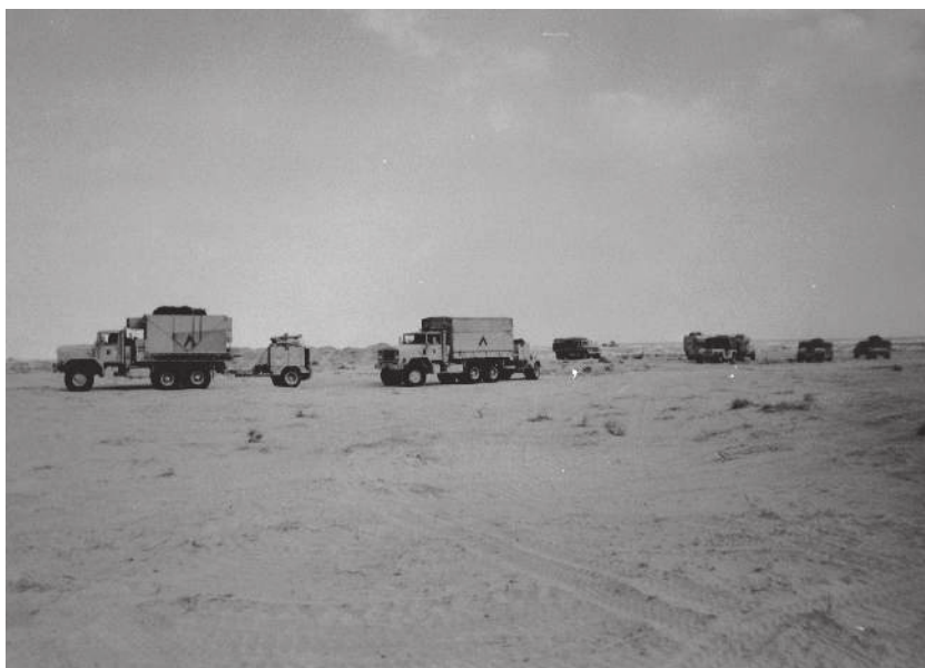
1st Infantry Division Artillery (DIVARTY) Tactical Fire Direction System (TAC-FIRE) vehicles in convoy (February 1991).