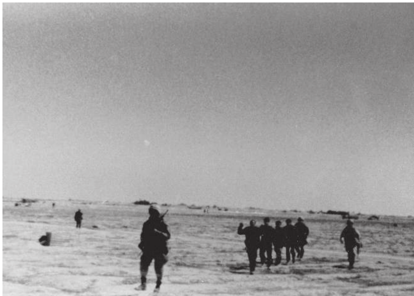
Iraqi prisoners of war (POWs) captured and escorted by soldiers of the 1st Infantry Division (February 1991).