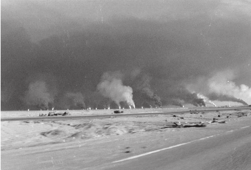
Burning oil wells with destroyed Iraqi equipment in the foreground (February–March 1991).