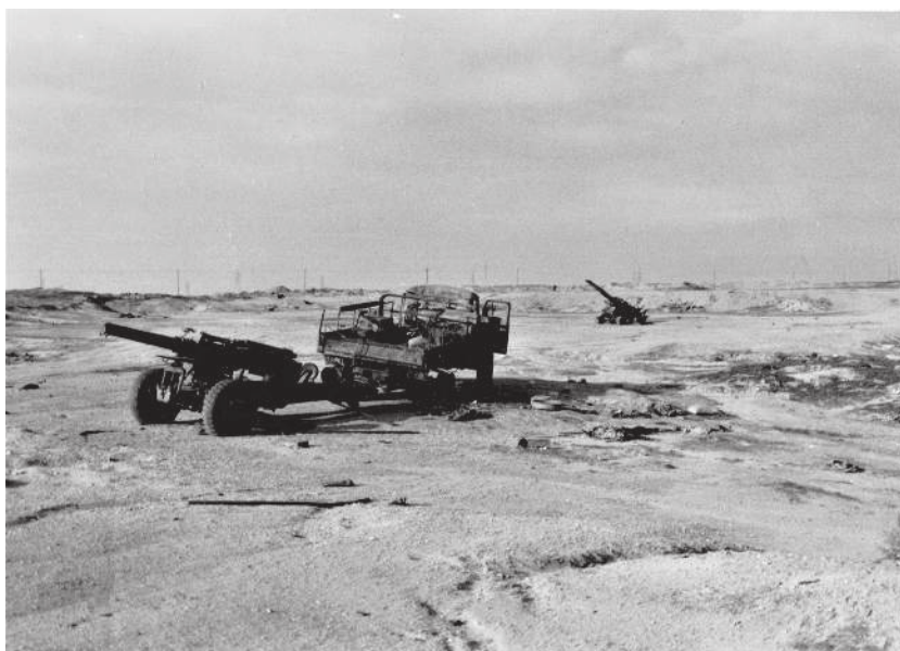
Destroyed Iraqi howitzer and truck in the vicinity of the "Highway of Death" in eastern Kuwait (February 28, 1991).