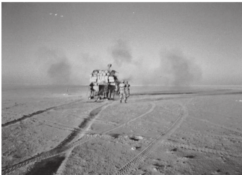
Howitzer from B Battery 1st Battalion, 5th Field Artillery firing on enemy positions (February 1991).