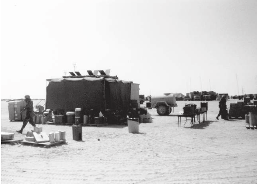
1st Infantry Division Artillery (DIVARTY) mobile kitchen trailer (MKT) (February 1991).